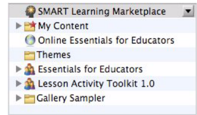
Select the SMART Learning Marketplace in the Gallery tab.

The SMART Learning Marketplace is a content subscription service that enables you to quickly find and integrate digital learning objects, including images, manipulatives, multimedia files and extra resources into your lesson. You can use these learning objects when preparing your lesson in advance, or you can access the SMART Learning Marketplace during your lesson to locate high quality resources as you and your students need them. To subscribe or log in, select SMART Learning Marketplace in the SMART Notebook software Gallery or go to www.learningmarketplace.smarttech.com .