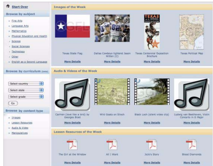
The search tool interface also includes images of popular learning objects when you use the SMART Learning Marketplace through a Web browser.

To search for content, do the following: